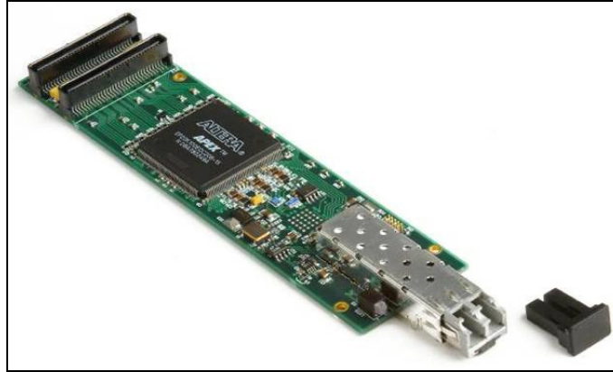
Figure 2: CERN/ALICE SIU optical daughtercard